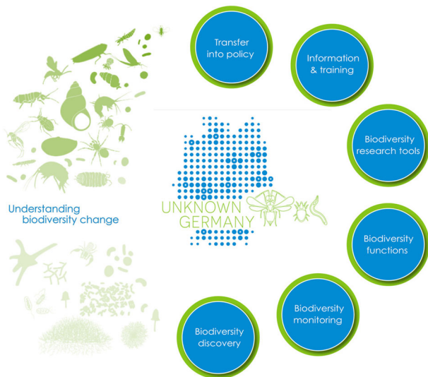
Fig. 2 | Objectives of the Unknown Germany initiative. The Unknown Germany initiative will discover and monitor biodiversity and its functions, accompanied by the development of new research tools and taxonomic training. The gained understanding of biodiversity change will be translated into practical recommendations for policy makers and conservation.