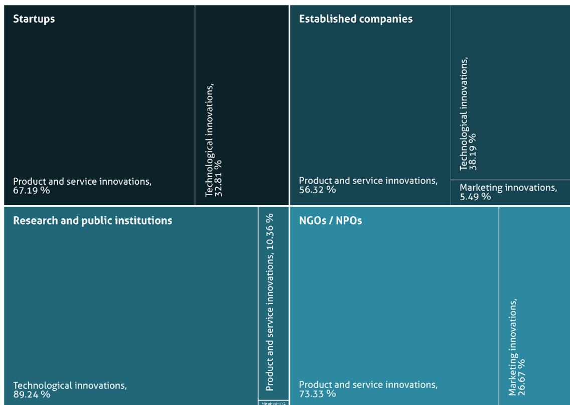
Figure 3. Organization types and (sustainability-oriented) innovation types. Note: \chi^2 = 232.27 ( p = 0.000 ), Cramer’s V (0.391, p = 0.000 ) and the contingency coefficient CC (0.484, p = 0.000 ).